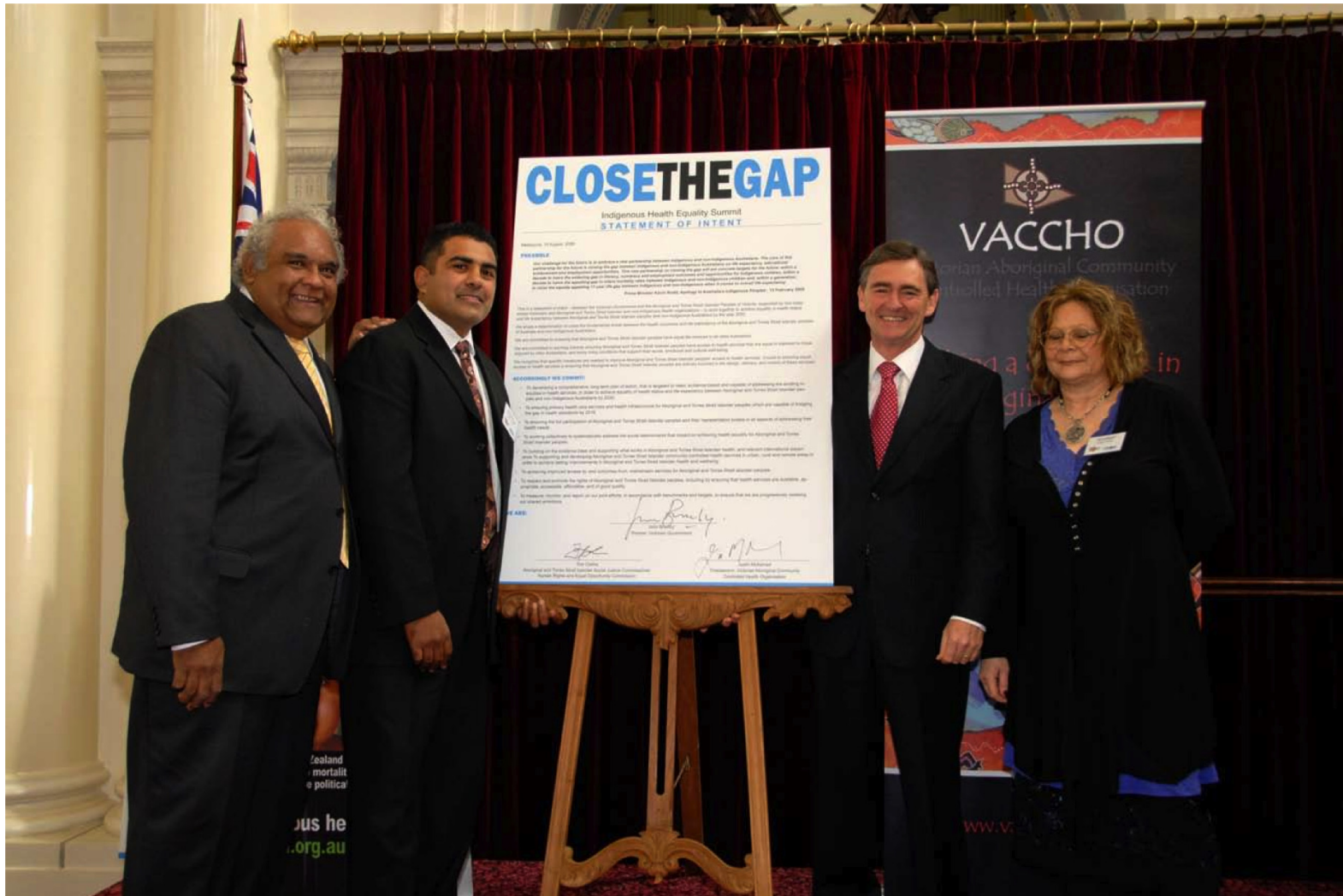
17 August 2008. VCOSS was asked to be one of the signatory organizations at the signing of the Statement of Intent to Close the Gap, by the Victorian Government with VACCHO (Victorian Aboriginal Community Controlled Health Organisation).